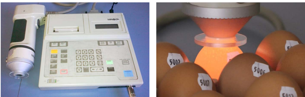
Figure 3: Reflectometer used to measure eggshell color

The L*a*b* Color System (also known as the CIE Lab System) was introduced in 1976 and is today one of the most commonly used systems for measuring object colors in many fields. With these three parameters, shell color can be described objectively within the color spectrum. As a* and b* increase (in absolute value) the saturation of the color increases.