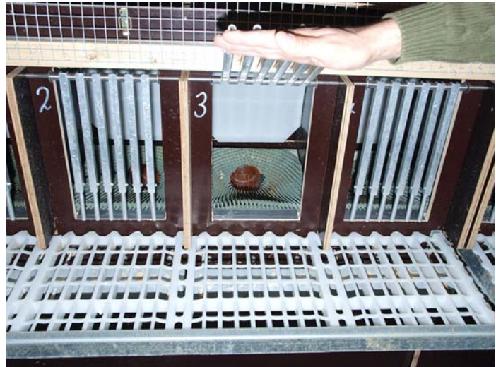
Figure 2: View of a Weihenstephan Funnel Nest Box

with a specifically developed single nest box. Based on this recording system, genetic parameters for behaviour and performance traits in group housing systems were estimated and families with desirable performance profile selected for line improvement in the primary breeding program of Lohmann Tierzucht.