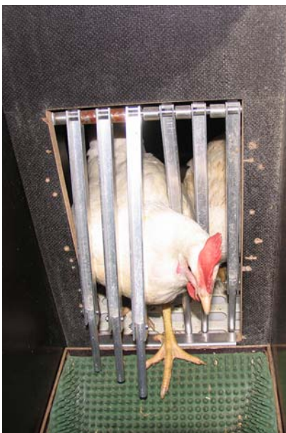
Figure 3: A hen in three phases: entering the nest, staying inside and leaving the nest.

In analysing components of nesting behaviour, main focus is on nest acceptance, i.e. counting the number of “saleable” eggs laid in the nest. At the experimental station Thalhausen, distinctly different white-egg and brown-egg strains of Lohmann origin were performance-tested in pens for 360 hens, equipped with Funnel Nest Boxes. Daily nest visits were recorded with oviposition time for each hen during a period of up to one year. On the basis of the recorded number of nest eggs per hen, a family breeding value can be estimated for egg production, taking into account nest acceptance, which is then combined with traditional selection criteria in a selection index.