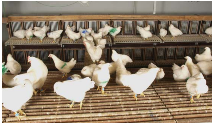
Figure 1: Experimental unit with 48 single nest boxes for individual testing in floor housing systems

The most important nesting behaviour trait, nest acceptance, is largely influenced by training and management, beginning during the rearing period. After transfer to the production house, adjustment of the laying nests to the requirements of the hens and frequent collection of misplaced eggs are important to